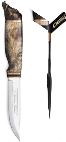
WILD BOAR 546013W Blade: stainless steel Handle: color waxed curly birch & bronze Sheath: leather Blade length: 11 cm Overall length: 24 cm Packaging: wooden gift box