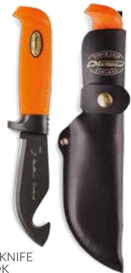
SKINNING KNIFE WITH HOOK MARTEF