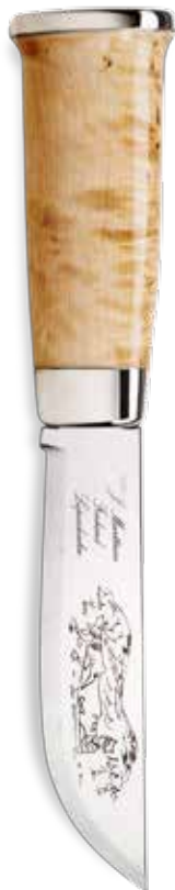
LAPP KNIFE 240

230010 Blade: stainless steel Handle: curly birch Sheath: leather Blade length: 11 cm Overall length: 22 cm