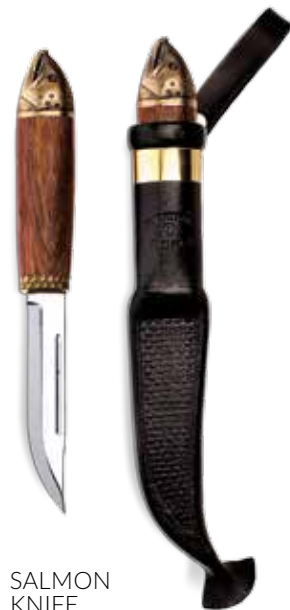
SALMON KNIFE 552010W Blade: stainless steel Handle: heat treated curly birch & bronze Sheath: leather Blade length: 11 cm Overall length: 24 cm Packaging: wooden gift box