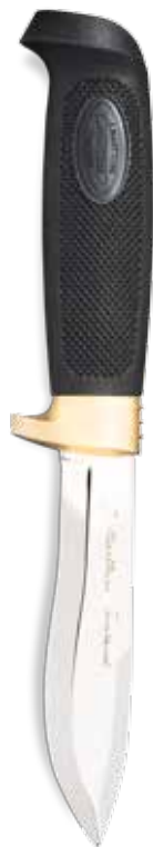
CONDOR GAME SKINNER

185015 Blade: stainless steel Handle: rubber Sheath: leather Blade length: 9 cm Overall length: 21 cm