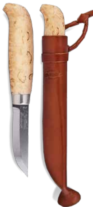
CARBINOX CURLY BIRCH

543015 Blade: stainless steel Handle: curly birch & heat treated birch Sheath: leather Blade length: 16 cm Overall length: 29 cm