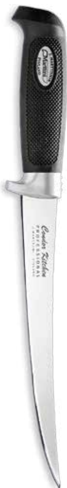
FILLETING KNIFE 7.5" CKP

757114P Blade: stainless steel Handle: rubber Blade length: 19 cm Overall length: 31 cm