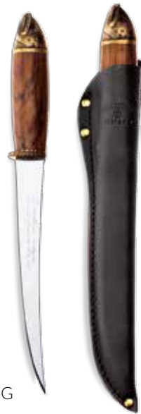
SALMON FILLETING KNIFE 552017W Blade: stainless steel Handle: heat treated curly birch & bronze Sheath: leather Blade length: 19 cm Overall length: 31 cm Packaging: wooden gift box