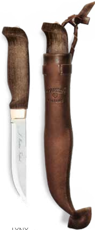
LYNX LUMBERJACK STAINLESS

127012 Blade: carbon steel Handle: stained birch Sheath: leather Blade length: 10 cm Overall length: 22 cm