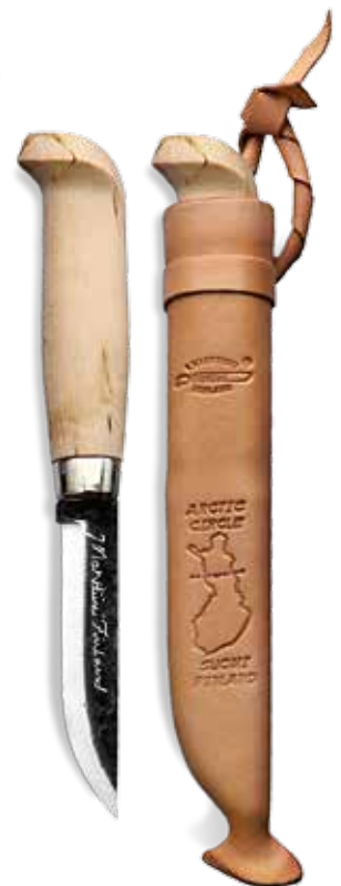
ARCTIC CIRCLE KNIFE

127019 Blade: carbon steel Handle: stained birch Sheath: leather Blade length: 9 cm Overall length: 19.5 cm