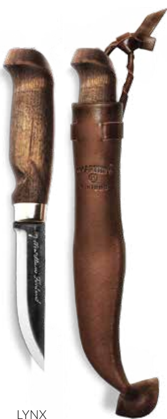
LYNX LUMBERJACK CARBON

127012 Blade: carbon steel Handle: stained birch Sheath: leather Blade length: 10 cm Overall length: 22 cm