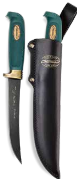
HUNTER'S BONING / CARVING KNIFE MARTEF

Blade: stainless steel with Martef coating Handle: rubber Sheath: leather Blade length: 11 cm Overall length: 23 cm