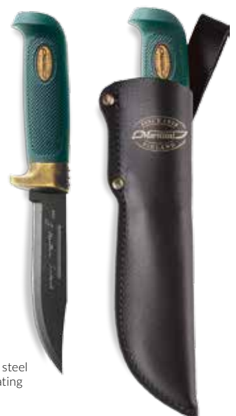
BIG GAME MARTEF

Blade: stainless steel with Martef coating Handle: rubber Sheath: leather Blade length: 15 cm Overall length: 27 cm