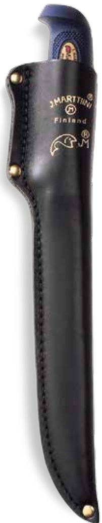
FILLETING KNIFE MARTEF 6"

826014T Blade: stainless steel with Martef coating Handle: rubber Sheath: leather Blade length: 15 cm Overall length: 27 cm