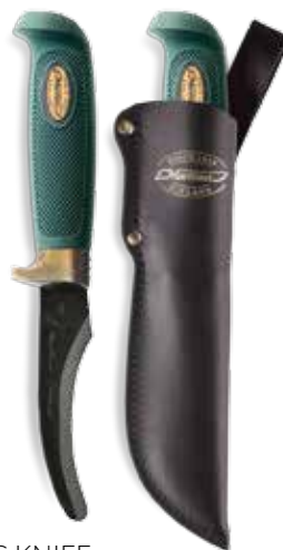
SKINNING KNIFE MARTEF

Blade: stainless steel with Martef coating Handle: rubber Sheath: leather Blade length: 11 cm Overall length: 25 cm