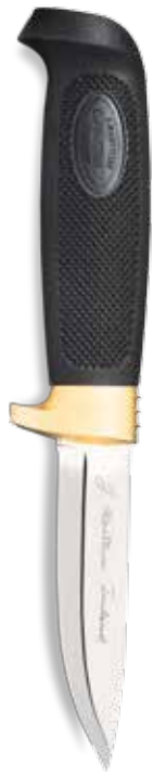
CONDOR DROP POINT

185013 Blade: stainless steel Handle: rubber Sheath: leather Blade length: 9 cm Overall length: 21 cm