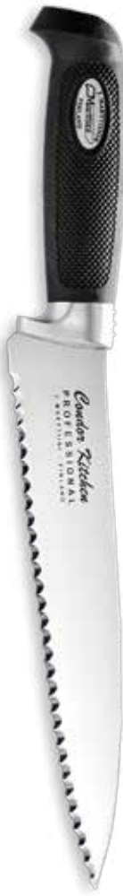
BREAD KNIFE CKP

765114P Blade: stainless steel Handle: rubber Blade length: 19.5 cm Overall length: 31 cm