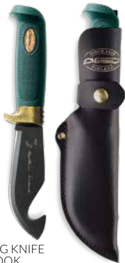
SKINNING KNIFE WITH HOOK MARTEF