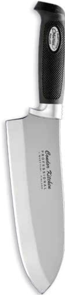
CHOPPING KNIFE CKP

770114P Blade: stainless steel Handle: rubber Blade length: 21 cm Overall length: 33 cm