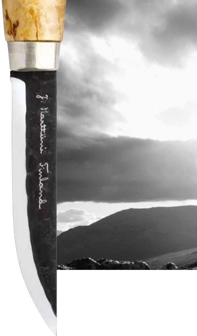
LYNX forged blade 131012 Blade: forged carbon steel blade Handle: curly birch Sheath: leather Blade length: 11 cm Overall length: 23 cm