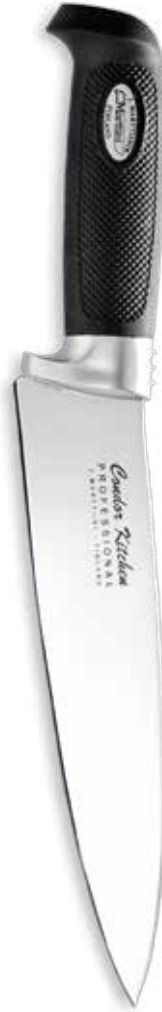
COOK KNIFE CKP

755114P Blade: stainless steel Handle: rubber Blade length: 15 cm Overall length: 27 cm