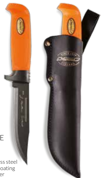
BIG GAME MARTEF

Blade: stainless steel with Martef coating Handle: rubber Sheath: leather Blade length: 15 cm Overall length: 27 cm