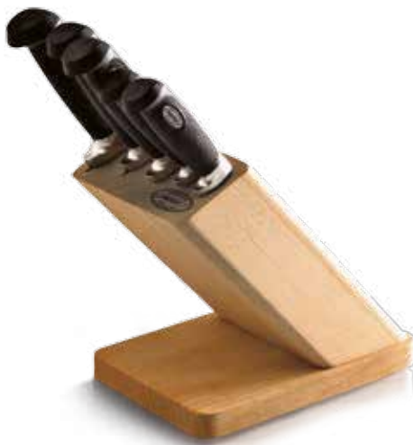
KNIFE BLOCK CKP with 5 knives

780114P Blade: stainless steel Handle: rubber Blade length: 18.5 cm Overall length: 30 cm