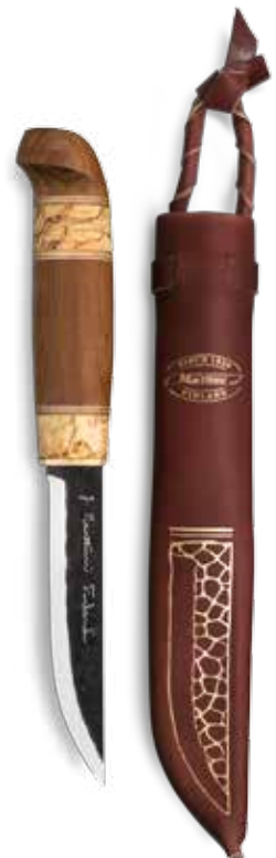
KIERINKI 126010 Blade: forged carbon steel blade Handle: heat treated birch / curly birch Sheath: leather Blade length: 11 cm Overall length: 23 cm