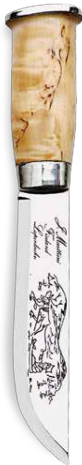
LAPP KNIFE 250

240010 Blade: stainless steel Handle: curly birch Sheath: leather Blade length: 13 cm Overall length: 24 cm