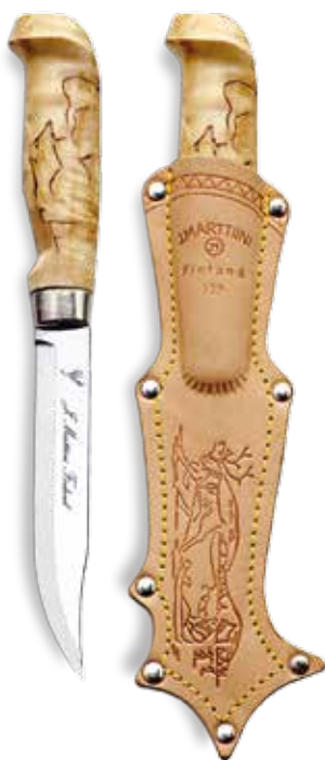
LYNX 139 139010 Blade: stainless steel Handle: curly birch Sheath: leather Blade length: 13 cm Overall length: 24 cm