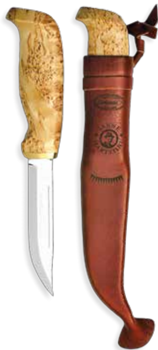
BIG LYNX 138015 Blade: stainless steel Handle: curly birch Sheath: leather Blade length: 11 cm Overall length: 23,5 cm