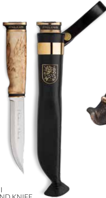
SUOMI FINLAND KNIFE 548018W Blade: stainless steel Handle: curly birch & bronze Sheath: leather Blade length: 11 cm Overall length: 22 cm Packaging: wooden gift box