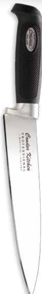
ROAST KNIFE CKP

754114P Blade: stainless steel Handle: rubber Blade length: 15 cm Overall length: 27 cm