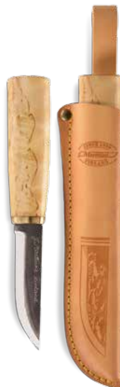
CARVING KNIFE ARCTIC

131016 Blade: carbinox Handle: curly birch Sheath: leather Blade length: 8.5 cm Overall length: 20 cm