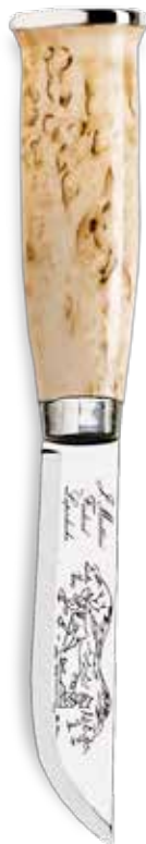
LAPP KNIFE 230

230010 Blade: stainless steel Handle: curly birch Sheath: leather Blade length: 11 cm Overall length: 22 cm