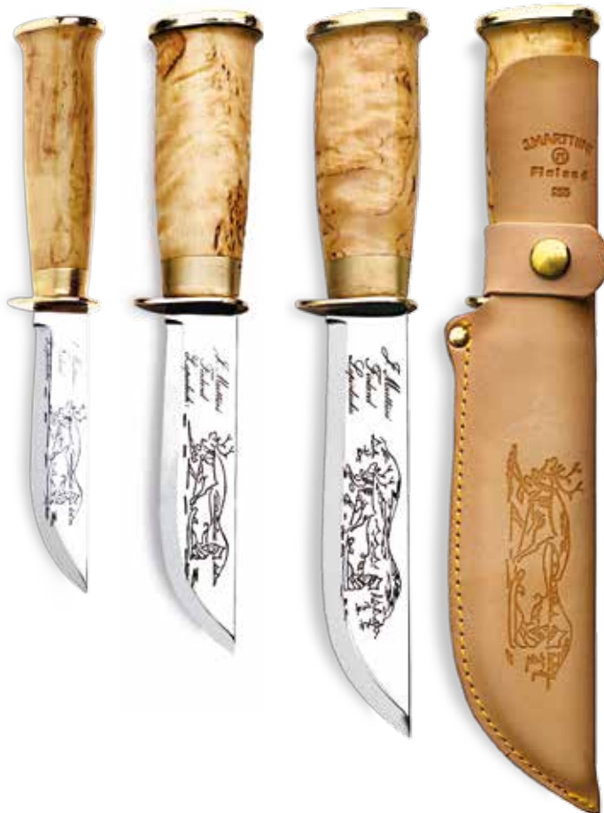
LAPP KNIFE 280 280015 Blade: stainless steel Handle: curly birch Sheath: leather Blade length: 45 cm Overall length: 56 cm