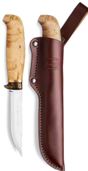
LYNX 134 bronze finger guard 134012 Blade: stainless steel Handle: curly birch Sheath: leather Blade length: 11 cm Overall length: 22 cm