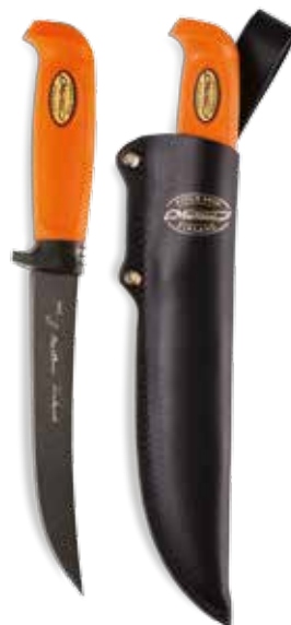
HUNTER'S BONING/ CARVING KNIFE MARTEF

Blade: stainless steel with Martef coating Handle: rubber Sheath: leather Blade length: 11 cm Overall length: 23 cm