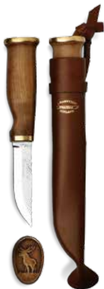
MOOSE KNIFE 547012W Blade: carbinox Handle: heat treated curly birch & bronze Sheath: leather Blade length: 8.5 cm Overall length: 20 cm Packaging: wooden gift box