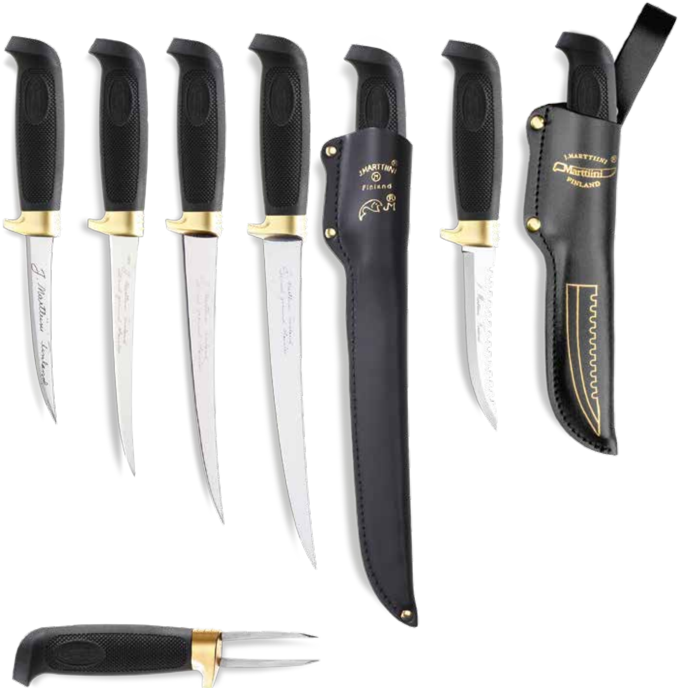
CONDOR GOLDEN TROUT 4"

816014 Blade: stainless steel Handle: rubber Sheath: leather Blade length: 10 cm Overall length: 20 cm