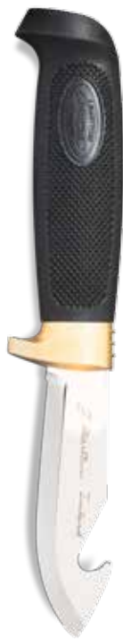
CONDOR GUT HOOK

185013 Blade: stainless steel Handle: rubber Sheath: leather Blade length: 9 cm Overall length: 21 cm