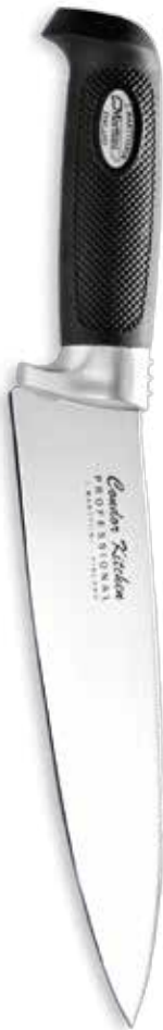
LITTLE COOK CKP

765114P Blade: stainless steel Handle: rubber Blade length: 19.5 cm Overall length: 31 cm